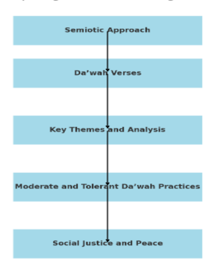
Figure 2: framework for exploring da'wah verses using a semiotic approach

Framework for Exploring Da'wah Verses Using a Semiotic Approach