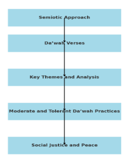
Figure 2: framework for exploring da'wah verses using a semiotic approach

Framework for Exploring Da'wah Verses Using a Semiotic Approach