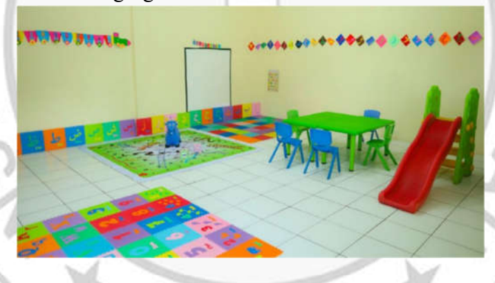
Figure 2. Classroom shape for classroom/learning services in early childhood education

Researchers can also illustrate that the existence of a comfortable classroom environment provides output to students in the formation of students' social personality, one of the benefits of the existence of classroom services provided to early childhood education students is to form a comfortable classroom atmosphere so that it can provide a sense of security and also confidence to students so that this can affect the sense of participation in students' social personal activities. The shape of the classroom applied in classroom services can be shown in the following figure: