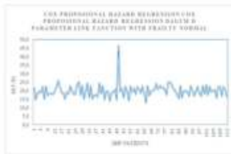
Fig. 3. Cox Proportional Hazard Regression dengan 3 parameter link function with frailty Normal

as maintaining cleanliness and health[42]. One thing that distinguishes it is the width of the interval between the patient's recovery rate because the average random effect parameter has a significant effect on the cure rate [43]. So it can be said that the case of dengue fever in Bojonegoro does depend on the variety component [42] It means that the difference in the value of the variance from the usual random effect \tau^2 is in a different confidence interval for the cure rate for dengue hemorrhagic fever. Cox proportional hazard regression of the three-link function parameters with frailty normal distribution can be used as a basic model for the Bojonegoro regency Health Department's consideration in taking policies to formulate strategic steps to accelerate recovery rate for dengue hemorrhagic fever.