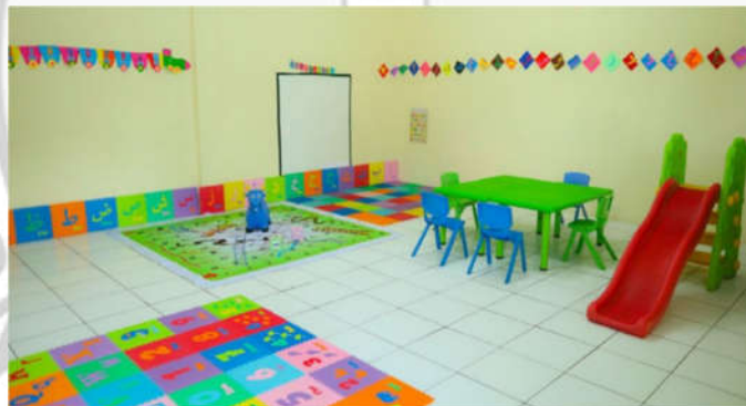
Figure 2. Classroom shape for classroom/learning services in early childhood education

Researchers can also illustrate that the existence of a comfortable classroom environment provides output to students in the formation of students' social personality, one of the benefits of the existence of classroom services provided to early childhood education students is to form a comfortable classroom atmosphere so that it can provide a sense of security and also confidence to students so that this can affect the sense of participation in students' social personal activities. The shape of the classroom applied in classroom services can be shown in the following figure: