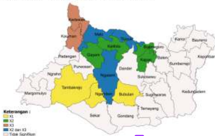
Figure 3. Grouping sub-district in Bojonegoro district based on the results of the partial test with the GWR method

Next, based on the results in Table 7, the variables' significant impact on the availability of rice in each sub-districts in district 5 is grouped into a group that has the same criteria that visualization in Figure 3.