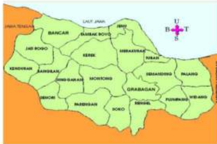
Fig. 1: Map of Tuban Regency