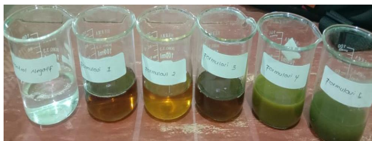
Figure 1. All Formulations of Hair Lotion

Organoleptic examination was carried out to observe any physical changes in the formulation, such as color changes, the appearance of odor or not, and texture changes. On texture observation, it is seen that the formulations is homogeneous. Organoleptic observations can also be used to test the physical stability of the formulation. The formulation can be declared stable if it does not experience a color change in the formulation (Nusmara, 2012). The stability of the formulation is influenced by environmental conditions such as temperature, light and pH. If a formulation is unstable, both physically and chemically, it can cause a decrease in the pharmacological effect of the active substance in the formulation (Oktami et al., 2021). The stability of the formulation is also influenced by several ingredients such as propylene glycol, glycerin, CMC-Na, antioxidant content. which is able to prevent oxidation such as sodium metabisulfite (Priskila, 2012; Sayuti, 2015).